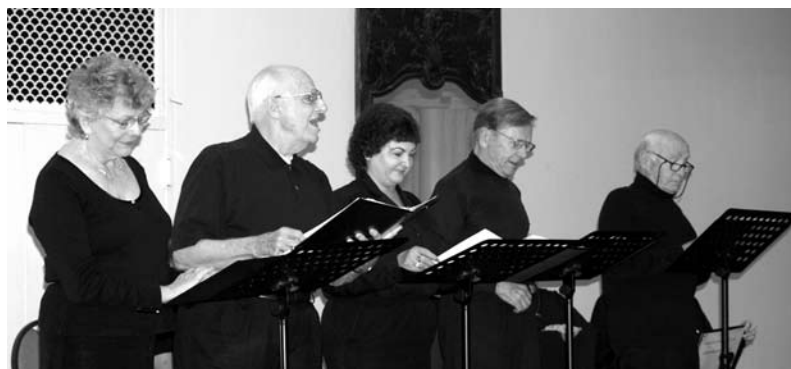
Grosse Point Theatre's Encore Players perform in readers theatre style.

Actors of all ages love to perform. So it will only be a matter of time before class members suggest they perform.